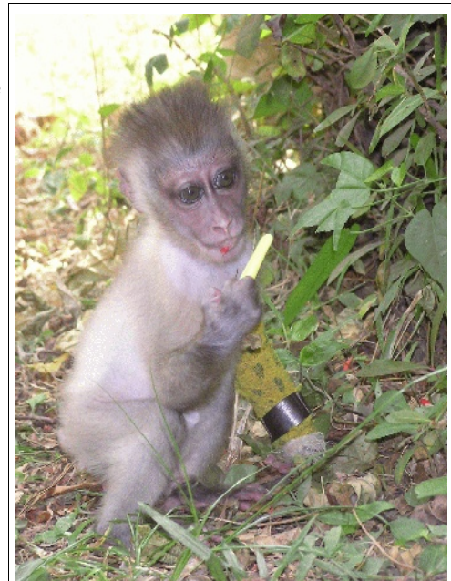
Ndokbagengue is the latest arrival in the Limbe Wildlife Center (LWC). She is about two months old and her arm got hurt when her mother was killed by hunters

Drills form the biggest group in the LWC. At this moment we house 49 drills in one big group and two more that have recently been brought in and still live in quarantine. Drills have become so rare in the wild that